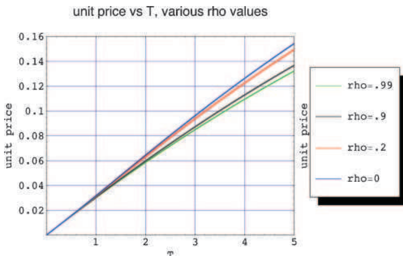
Figure 1. Indifference price of q=1 units of the variance swap as a function of time to maturity T , for different values of \rho .